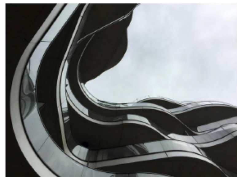
Plan Structure Superstructure